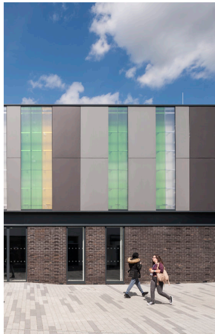
Box Theatre and Performing Arts Centre, New City College © Ayre Chamberlain Gaunt Architects

If the proposal is reviewed at an application stage the report will be a public document kept within the proposal's case file and published on Redbridge Council's website. Where the final review of a scheme takes place at a pre-application stage, the report of this meeting may also be made public once an application is submitted.