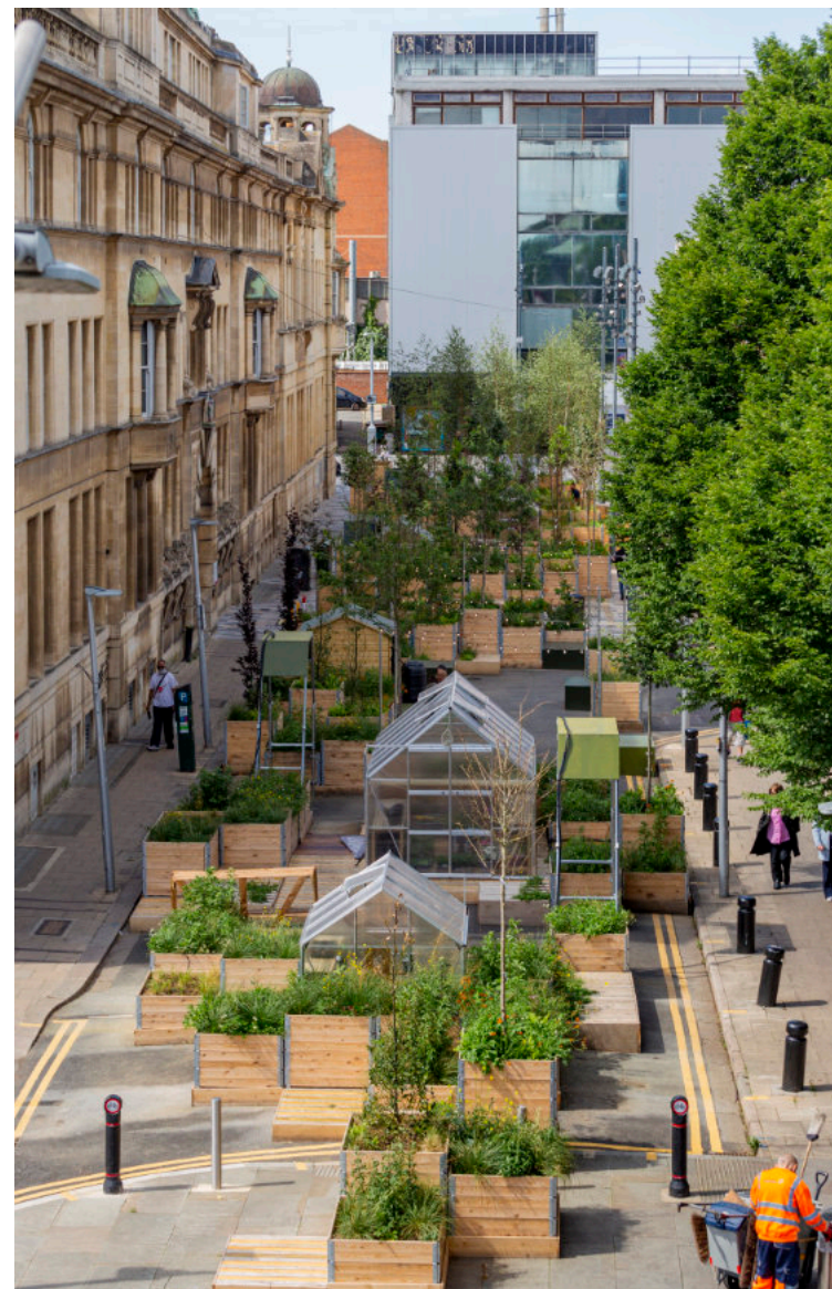
Wilderness Street, Ilford for Redbridge Council © Jan Kattein Architects