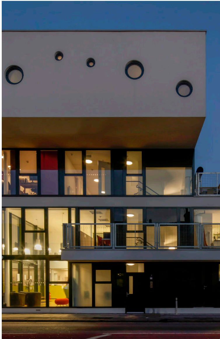
Redbridge Welcome Centre, Peter Barber Architects