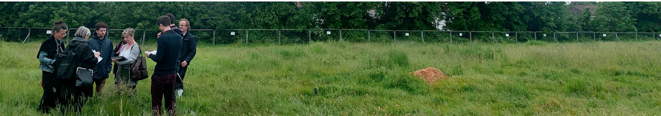
Redbridge Design Review Panel site visit

Design Review: Principles and Practice Design Council CABE / Landscape Institute / RTPI / RIBA (2013)