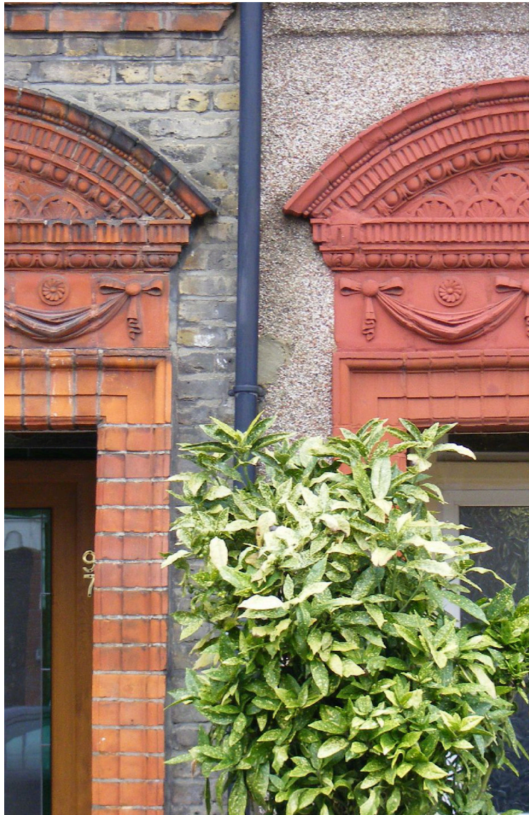
Iford Victorian porticos