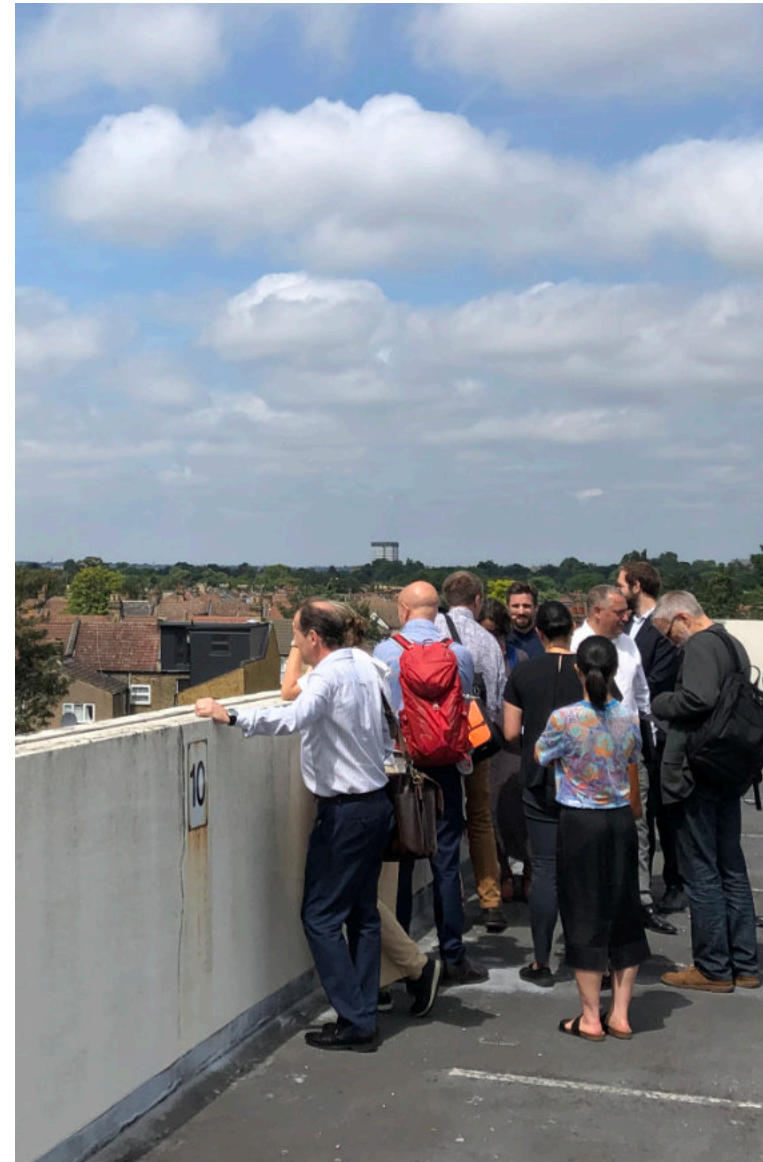
Redbridge Design Review Panel site visit

From time to time, it may be of benefit for specialist advice to be provided beyond the panel membership. In such cases, a professional with the relevant expertise may be invited to attend a review meeting, participating in the discussion with the status of an adviser to the panel.