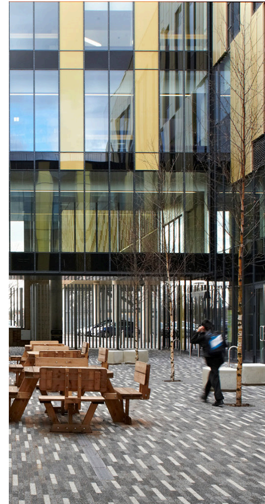
Issac Newton Academy © Feilden Clegg Bradley

Large projects, for example schemes with several development plots, may be split into smaller elements, to ensure that each component recenning officers on the policy context, and issues arising from pre-application discussions.