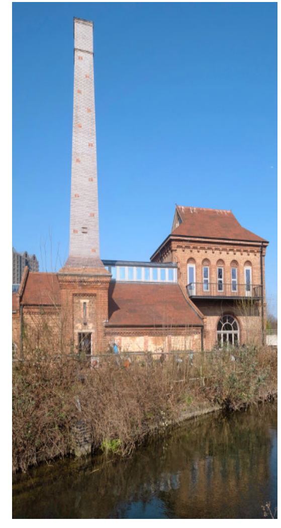
Walthamstow Wetlands

Large projects, for example schemes with several development plots, may be split into smaller elements, to ensure that each component receives adequate time for discussion.