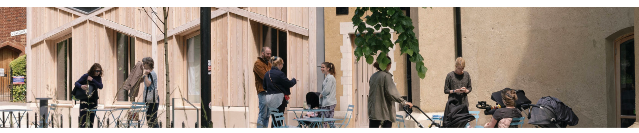
St Mary's Walthamstow, Matthew Lloyd Architects