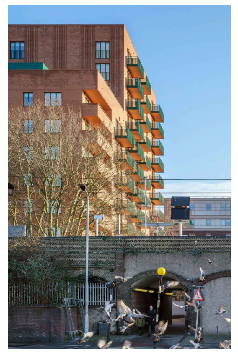
The Jazz House, Bell Phillips Architects