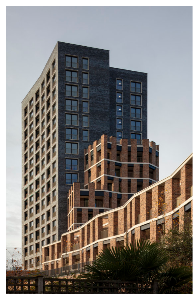
Juniper House, Pollard Thomas Edwards