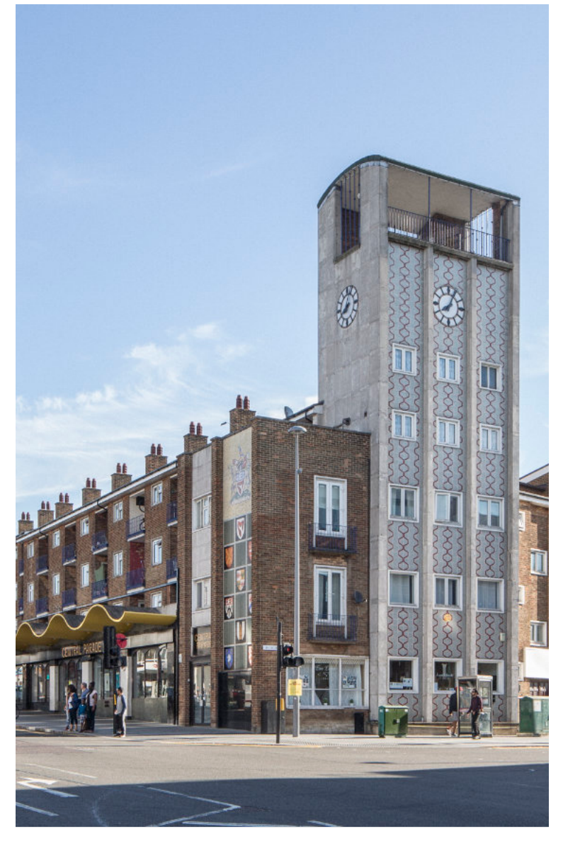
Central Parade, Gort Scott

From time to time, it may be of benefit for specialist advice to be provided beyond the Design Review Panel membership. In such cases, a professional with the relevant expertise may be invited to attend a review meeting, participating in the discussion with the status of an adviser to the panel.