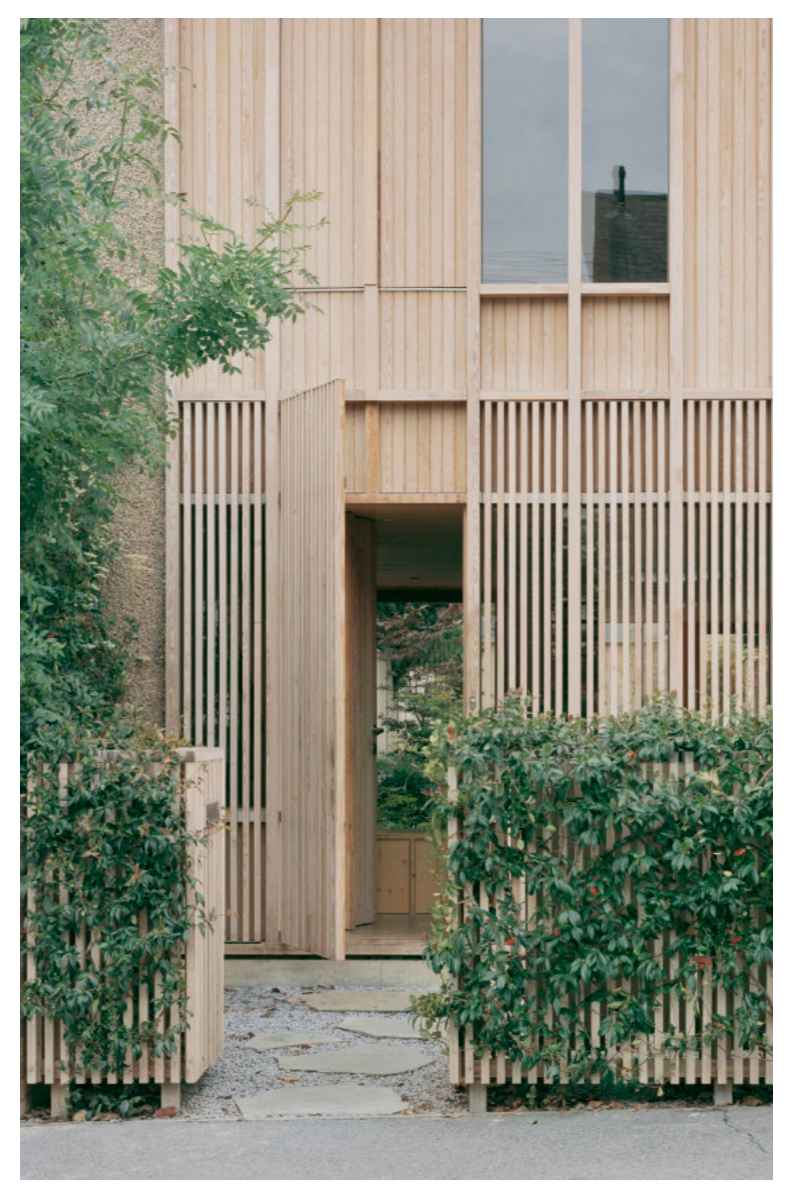
The Spruce House, ao-ft

If the proposal is reviewed at an application stage the report will be a public document kept within the proposal's case file and published on Waltham Forest Council's website. Where the final review of a scheme takes place at a pre-application stage, the report of this meeting may also be made public once an application is submitted.