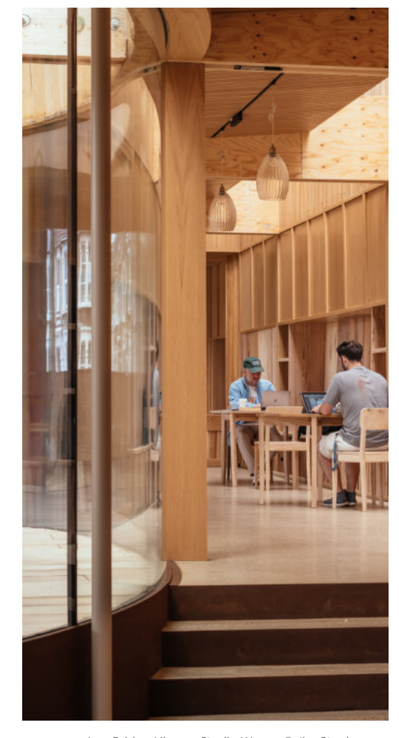
Lea Bridge Library, Studio Weave

www.london.gov.uk/sites/default/files/ggbd_london_design_review_charter_jan22.pdf