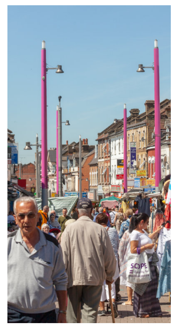
Walthamstow High Street

The panel will provide a rigorous review process, to ensure exemplary design in all areas of the borough, enhancing the area for all those who live, work, and visit here.