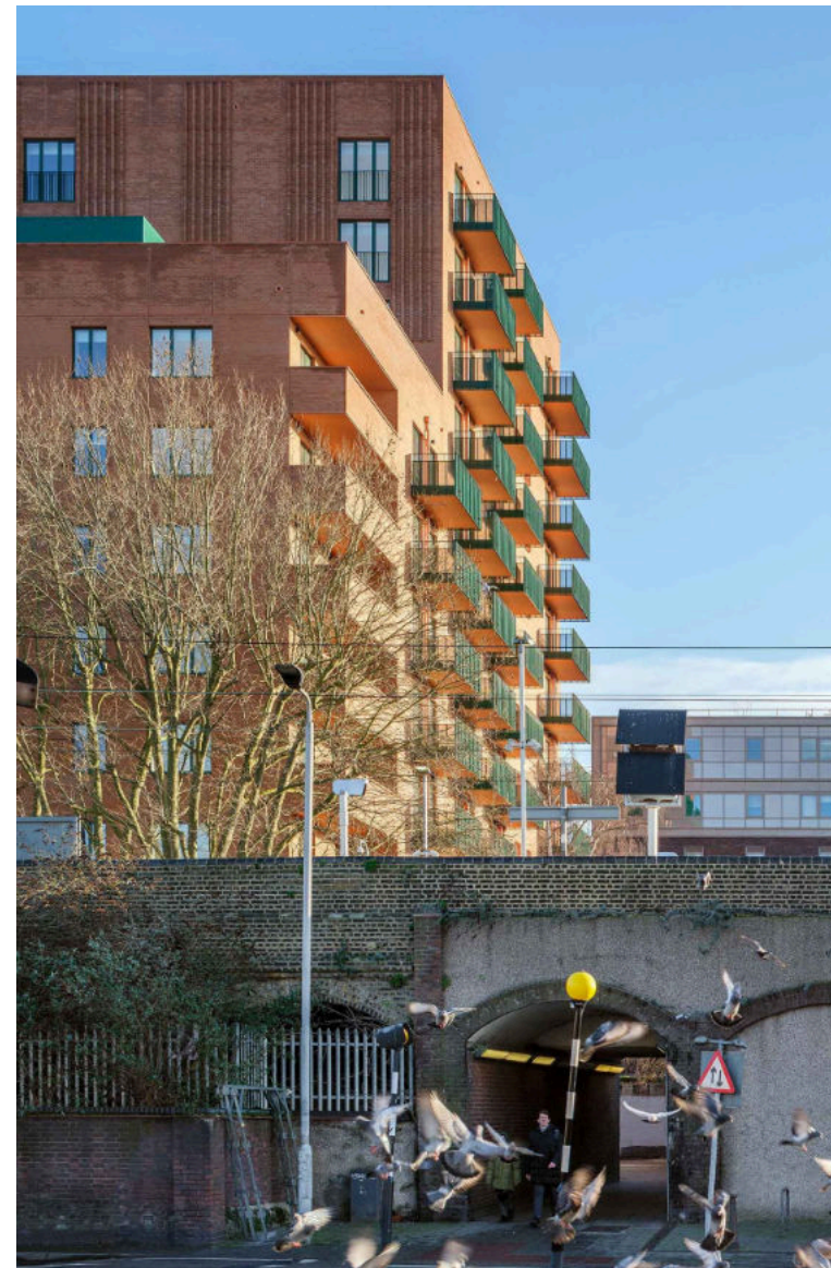
The Jazz House, Bell Phillips Architects