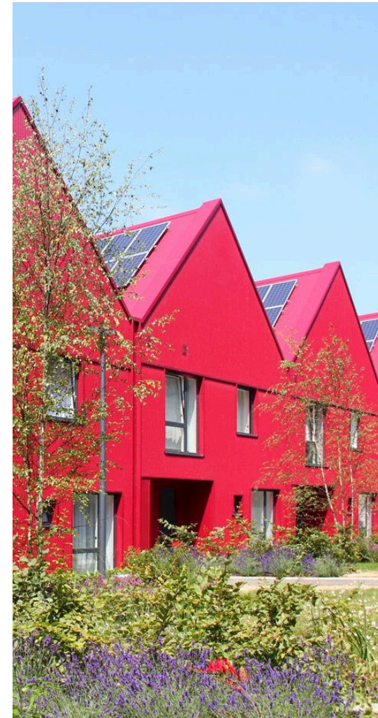
Sutherland Road, Levitt Bernstein

www.london.gov.uk/sites/default/files/ggbd_london_design_review_charter_jan22.pdf