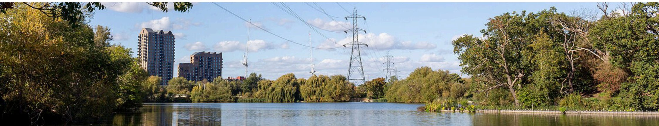
Walthamstow Wetlands

Any subsequent reviews will be charged for at the applicable rate (detailed in Section 15).