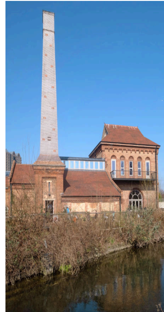
Walthamstow Wetlands

Large projects, for example schemes with several development plots, may be split into smaller elements, to ensure that each component receives adequate time for discussion.