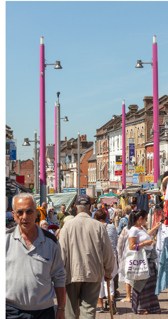
Walthamstow High Street

The panel will provide a rigorous review process, to ensure exemplary design in all areas of the borough, enhancing the area for all those who live, work, and visit here.