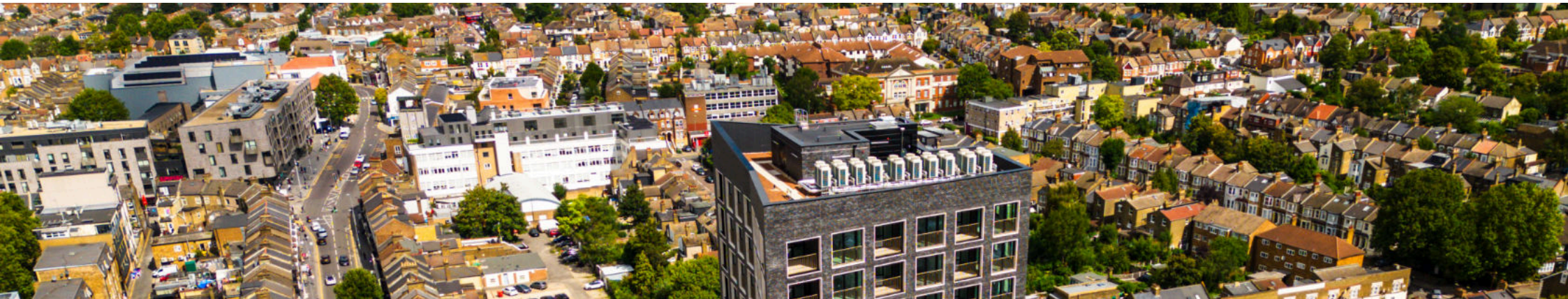
Aerial view

Design Review: Principles and Practice Design Council CABE / Landscape Institute / RTPI / RIBA (2013)