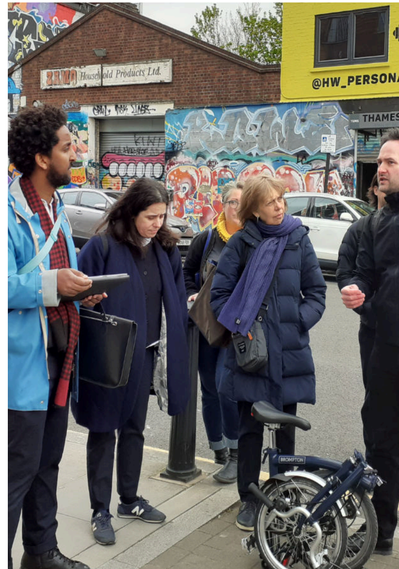
Site visit