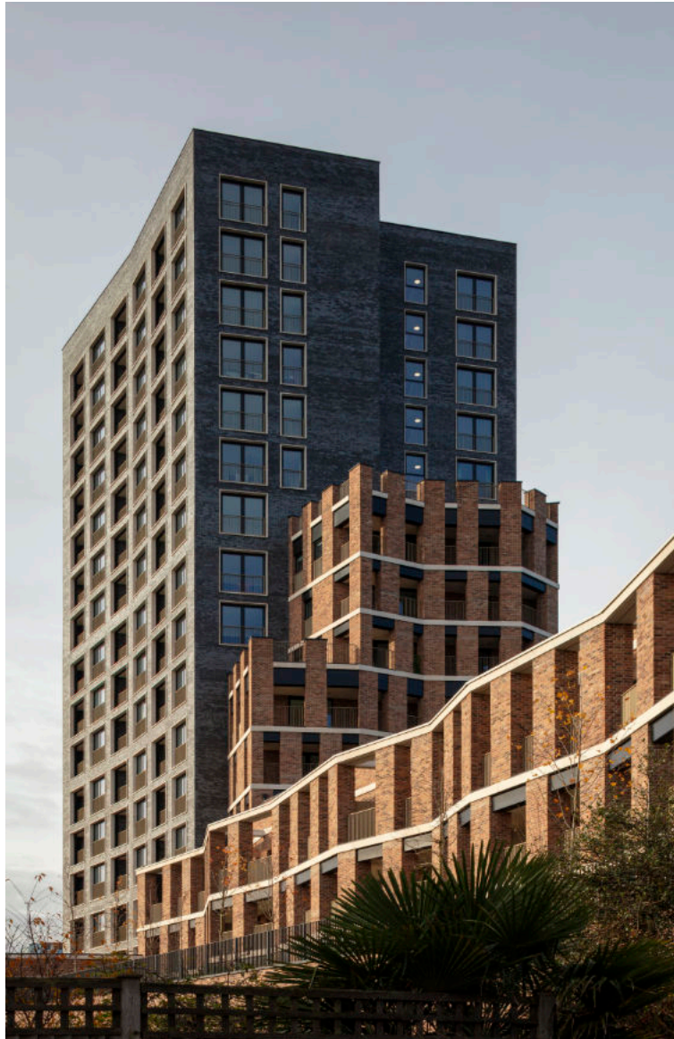
Juniper House by Pollard Thomas Edwards