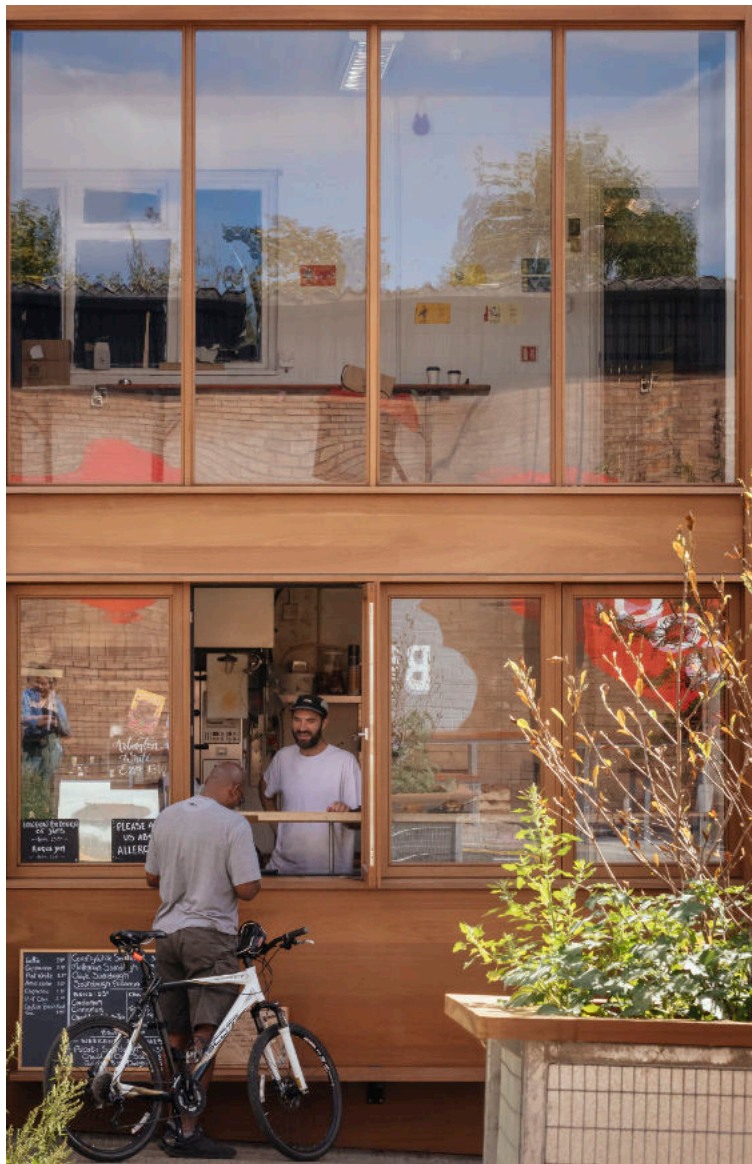
Lockwood Way