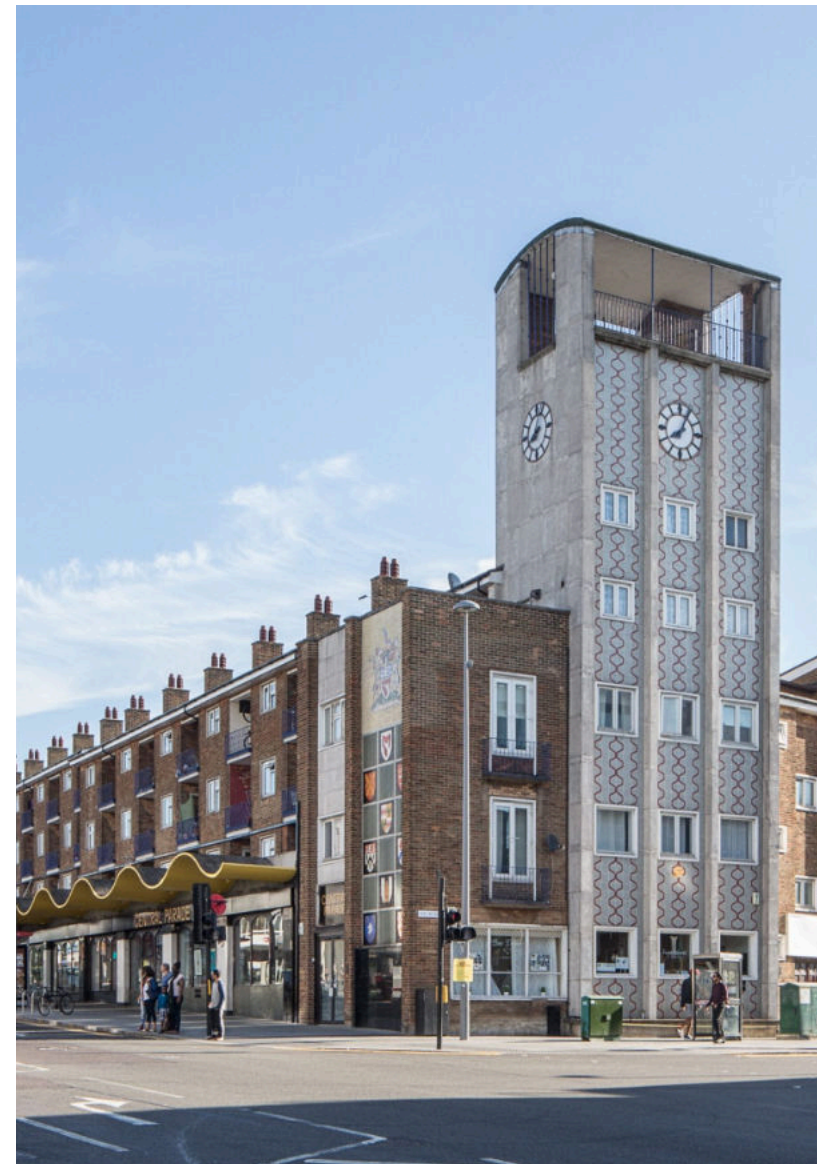
Central Parade, Gort Scott

From time to time, it may be of benefit for specialist advice to be provided beyond the Design Review Panel membership. In such cases, a professional with the relevant expertise may be invited to attend a review meeting, participating in the discussion with the status of an adviser to the panel.