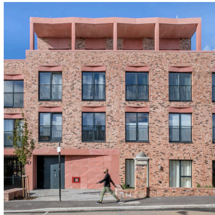
Gainsford Road by Gort Scott and Pocket Living

As a public authority, the London Borough of Waltham Forest is subject to the Freedom of Information Act 2000 (the Act). All requests made to Waltham Forest Council for information with regard to the Quality Review Panel will be handled according to the provisions of the Act. Legal advice may be required on a case by case basis to establish whether any exemptions apply under the Act.