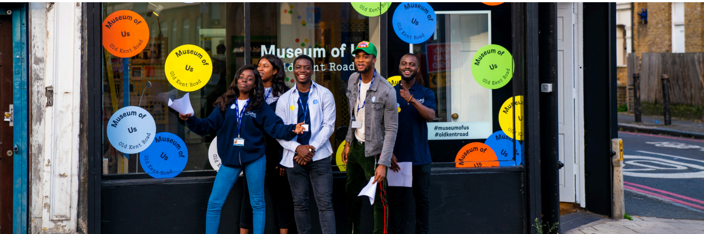
Old Kent Road opening

Community Review Panel members are entitled to claim reasonable expenses for travel to review meetings, and for other costs incurred in order to attend meetings. Frame Projects will provide an expense form which should be completed and sent to the Community Review Panel co-ordinator, with receipts or other evidence of expenditure, before the date of the next panel meeting.