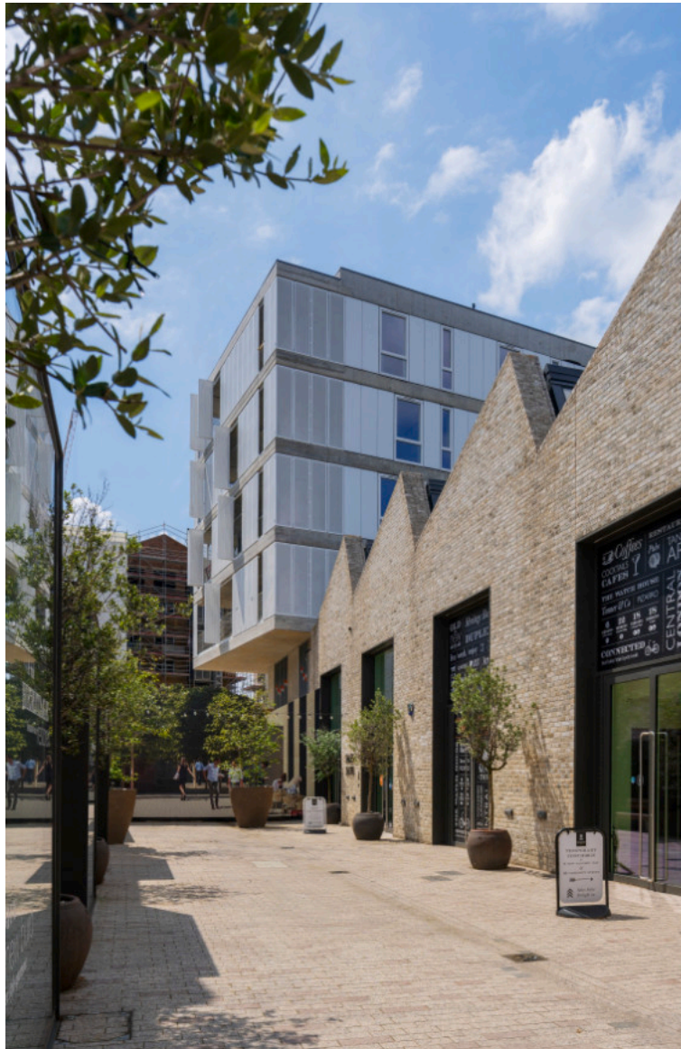
Rich Industrial Estate © London Square Developments Ltd