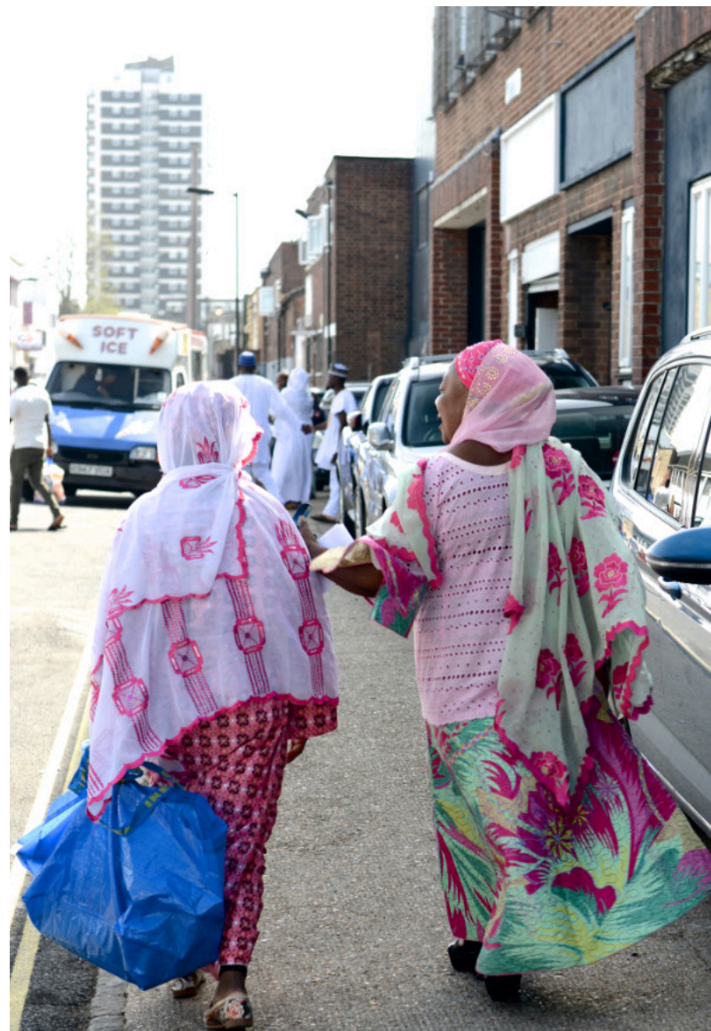
Ormside Street

Where a project returns for a second or subsequent review, the report of the previous review will be provided with the agenda.