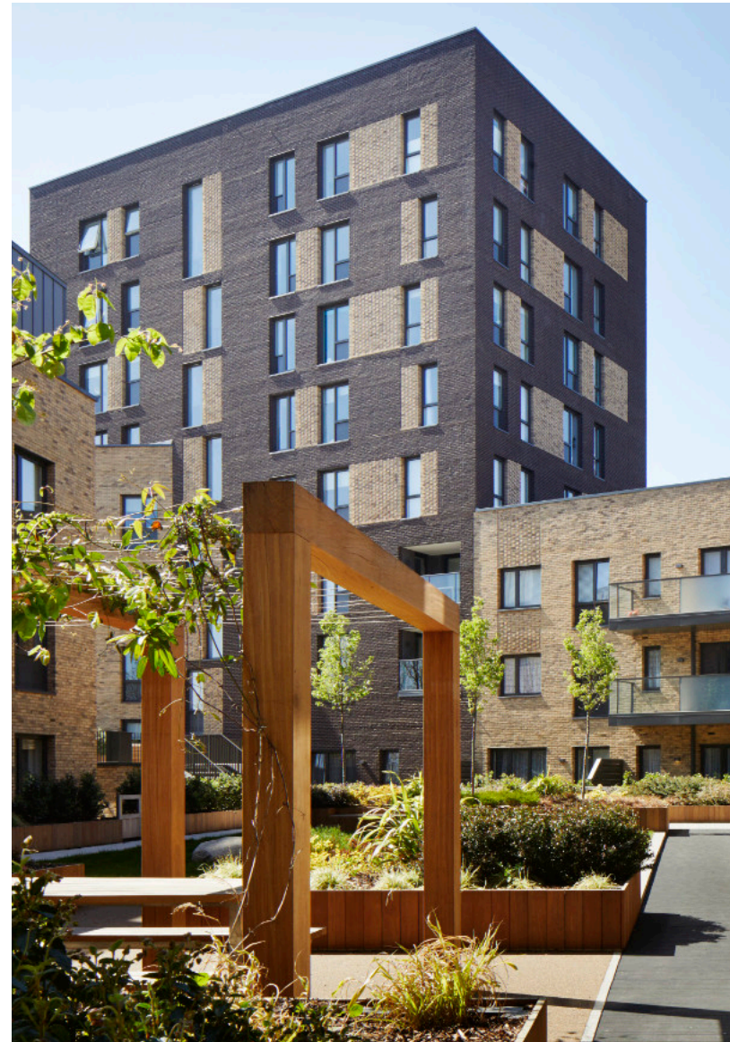
Peckham Place, Jestico + Whiles