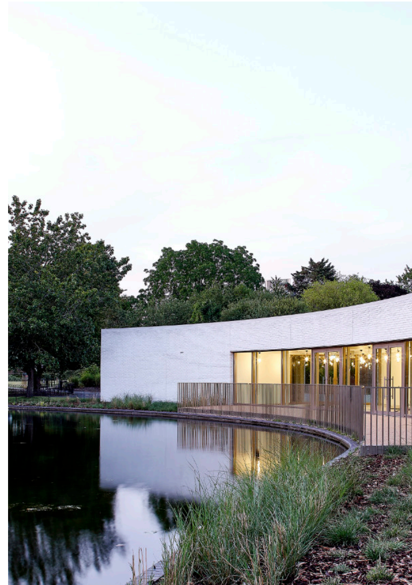
Southwark Park Pavilion, Bell Phillips Architects

www.london.gov.uk/sites/default/files/the_london_plan_2021.pdf