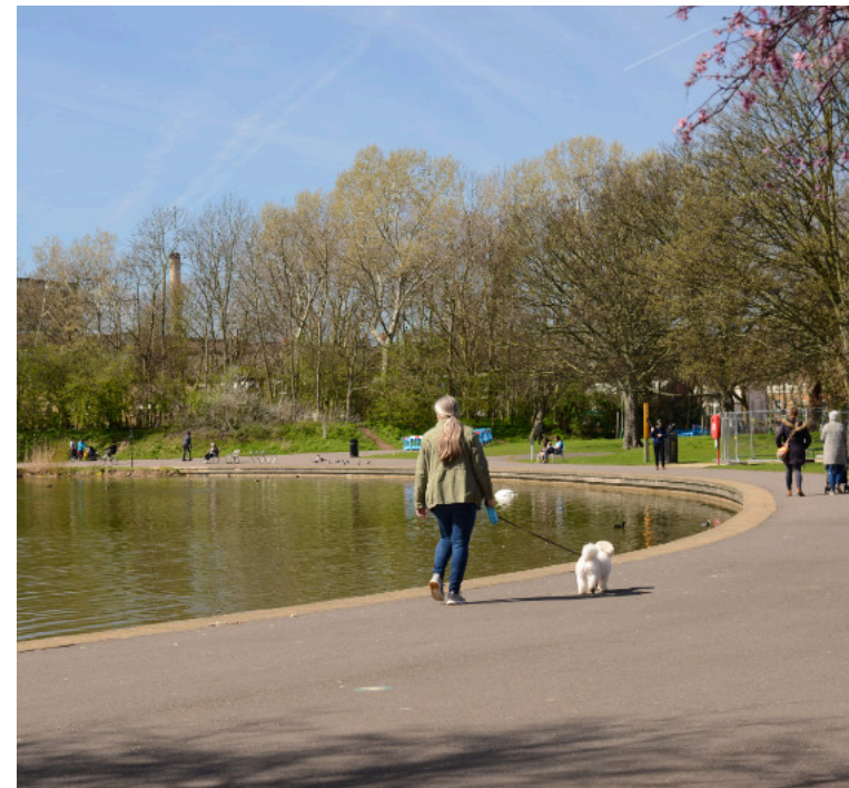
Burgess Park

As a public authority, Southwark Council is subject to the Freedom of Information Act 2000 (the Act). All requests made to the Council for information, with regard to the Community Review Panel, will be handled according to the provisions of the Act. Legal advice may be required on a case by case basis to establish whether any exemptions apply under the Act.