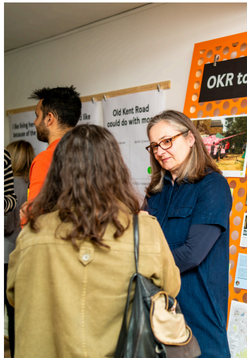
Launch of 231 Old Kent Road

If you would like a summary of this Handbook in your language, please contact Frame Projects.