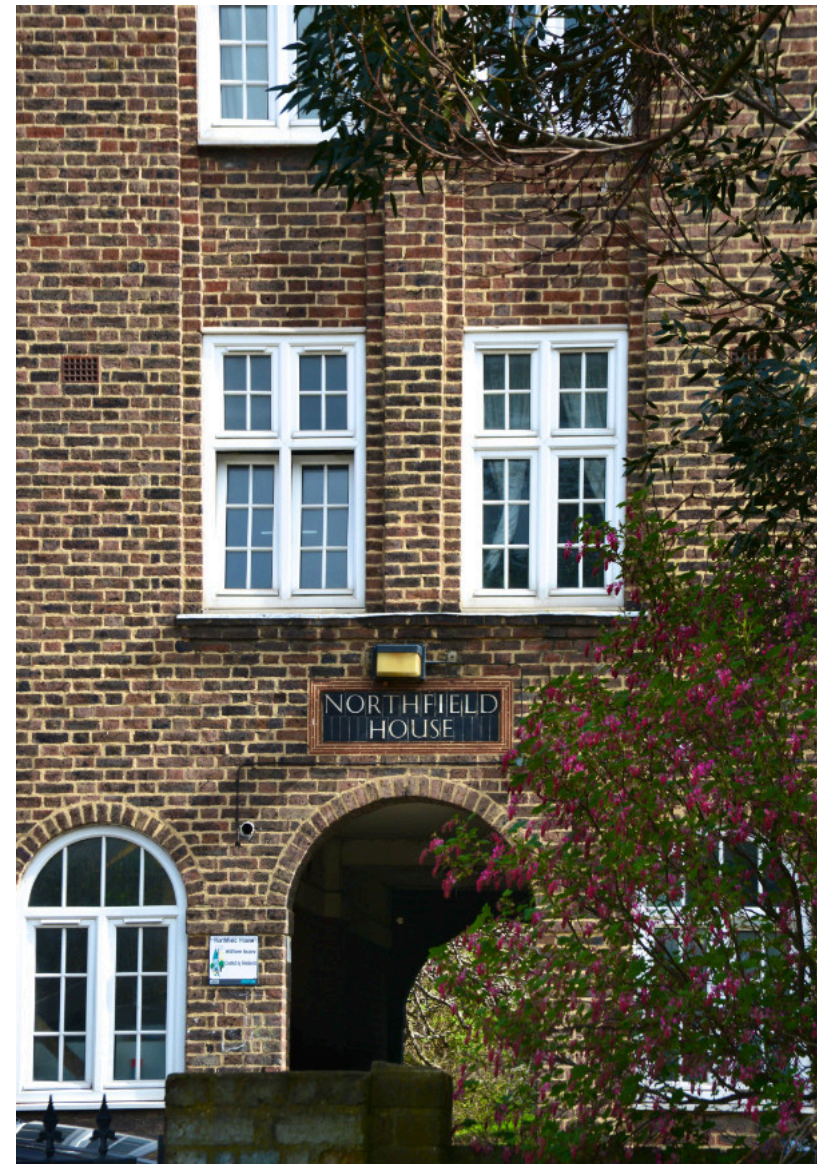
Northfield House