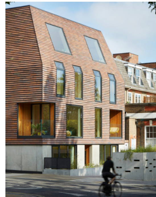
The Rye Apartments, Tikari Works

As with normal pre-application procedure, review advice given before an application is submitted remains confidential, seen only by the applicant, the planning authority and any other stakeholder bodies that the council has involved in the project. This encourages applicants to share proposals openly and honestly with the Community Review Panel – and ensures that they receive the most useful advice.