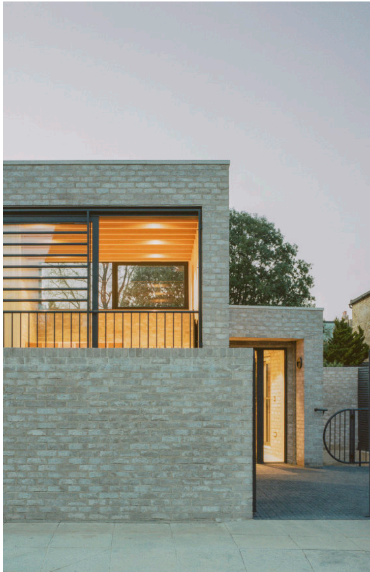
Tree House, Fletcher Crane Architects