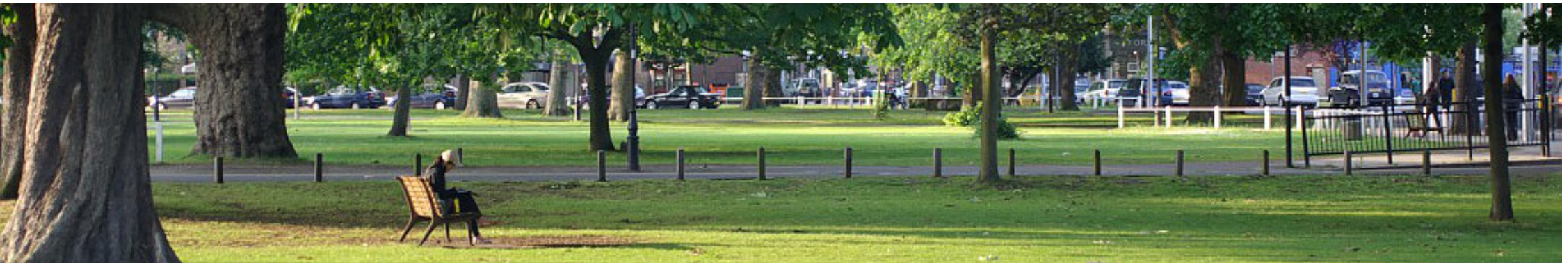
Ealing Green, Walpole Park

Large projects, for example schemes with several development plots, may be split into smaller elements, to ensure that each component receives adequate time for discussion.