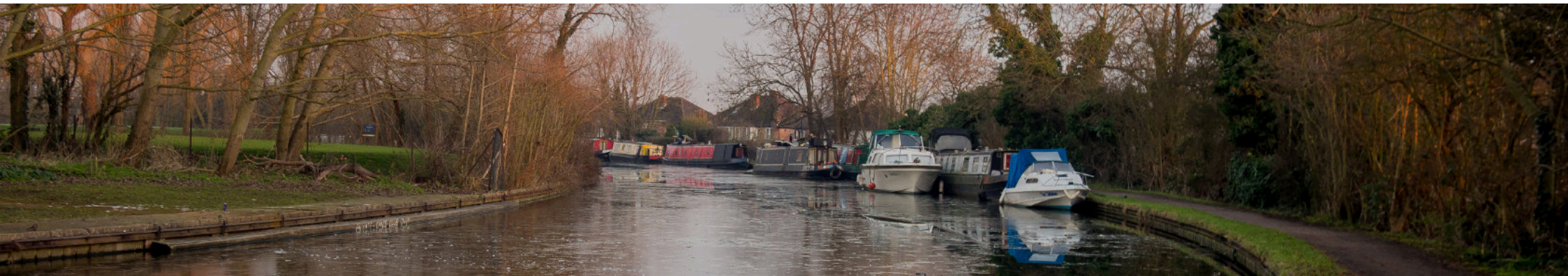
Grand Union Canal

Design Review: Principles and Practice Design Council CABE / Landscape Institute / RTPI / RIBA (2013)