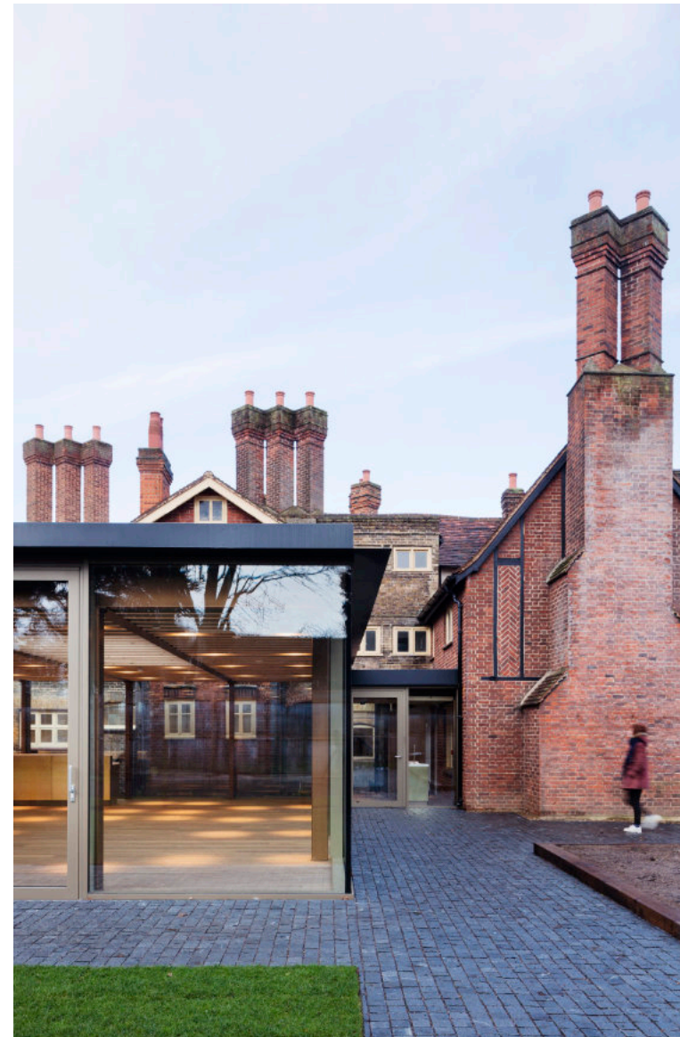
Southall Manor, Architecture 00