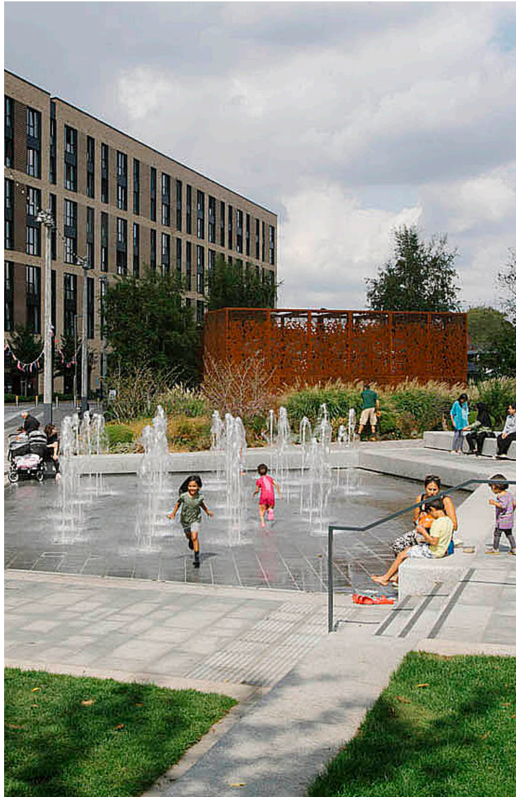
Tillerman Court, Greenford Quay, HTA Design