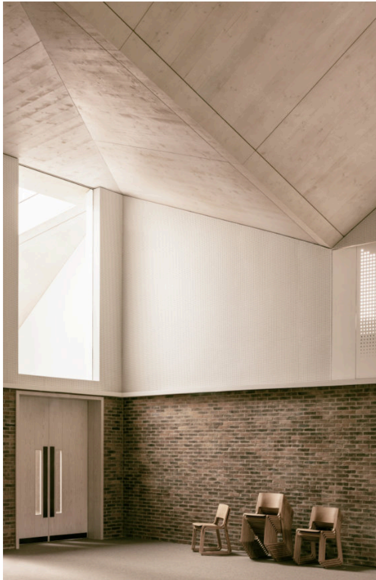
International Presbyterian Church