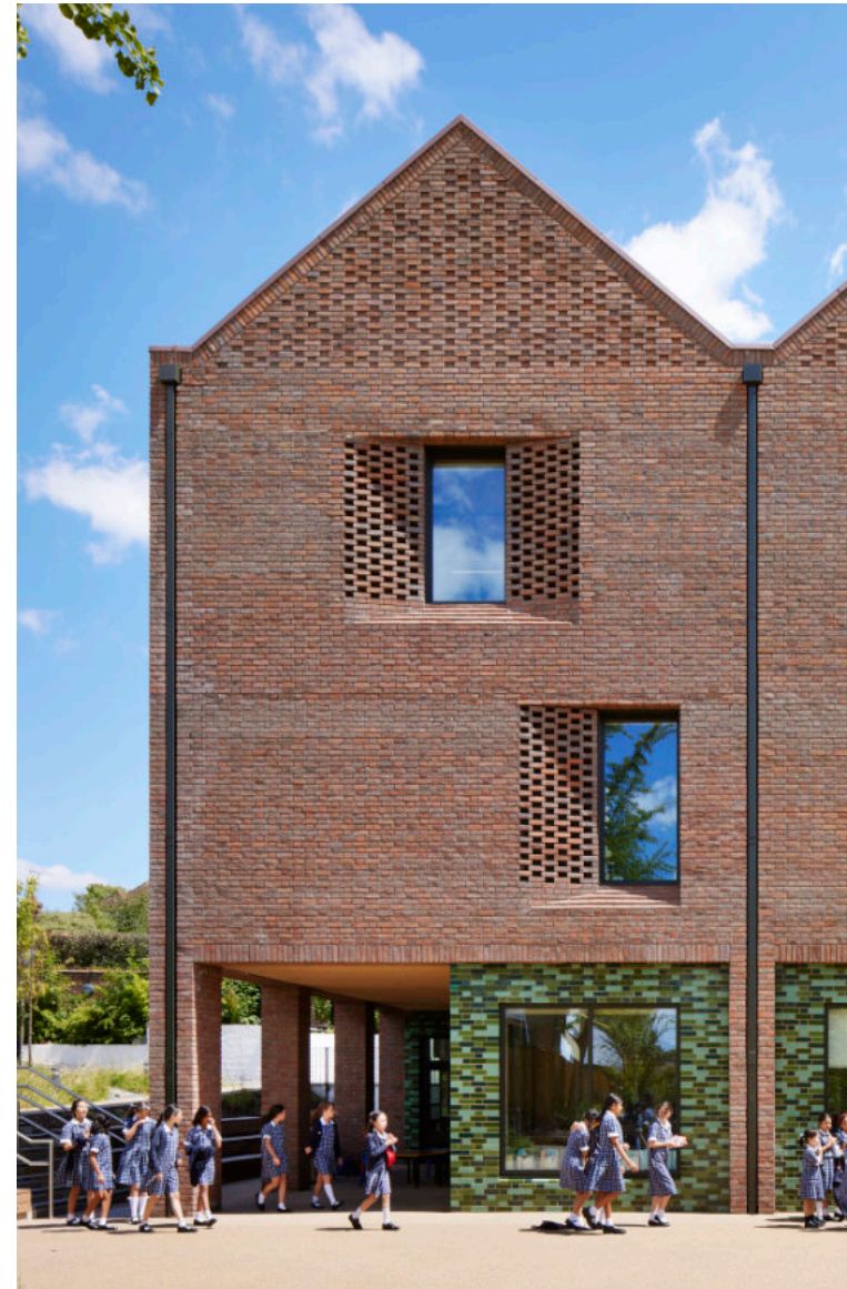
New Junior School for Notting Hill & Ealing High School, Hawkins\Brown

From time to time, it may be of benefit for specialist advice to be provided beyond the Design Review Panel membership. In such cases, a professional with the relevant expertise may be invited to attend a review meeting, participating in the discussion with the status of an adviser to the panel.