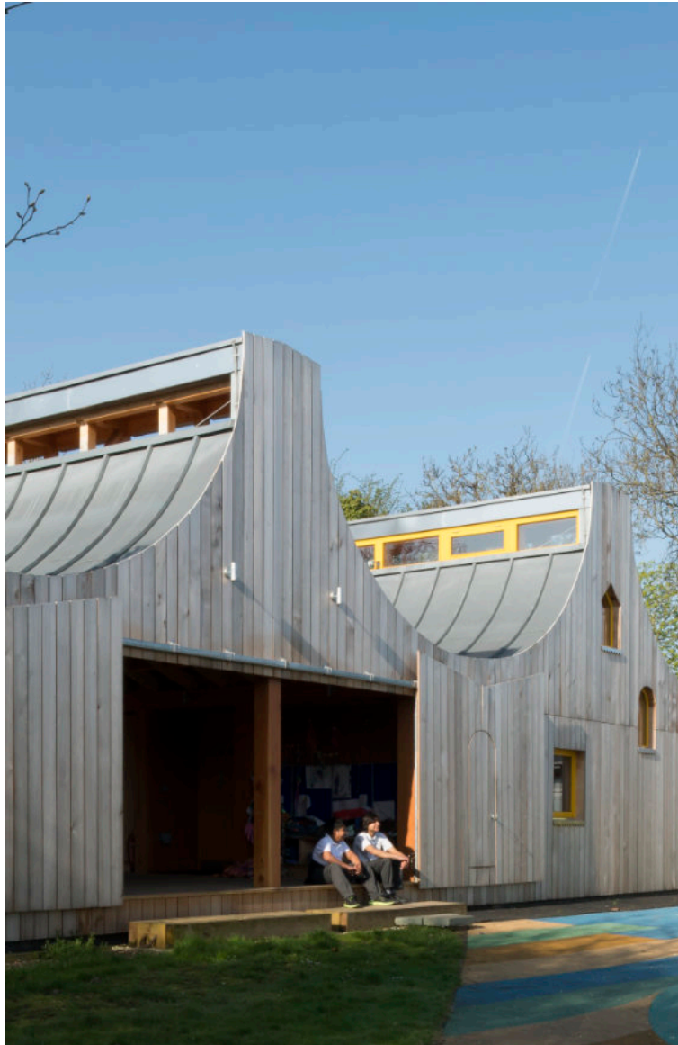
Belvue Woodland School, Studio Weave