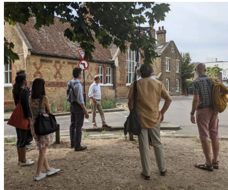
Ealing Design Review Panel site visit

As part of this annual review process, a meeting will be held with key Ealing Council officers and the panel chair to discuss the report and consider any recommendations for the following year.