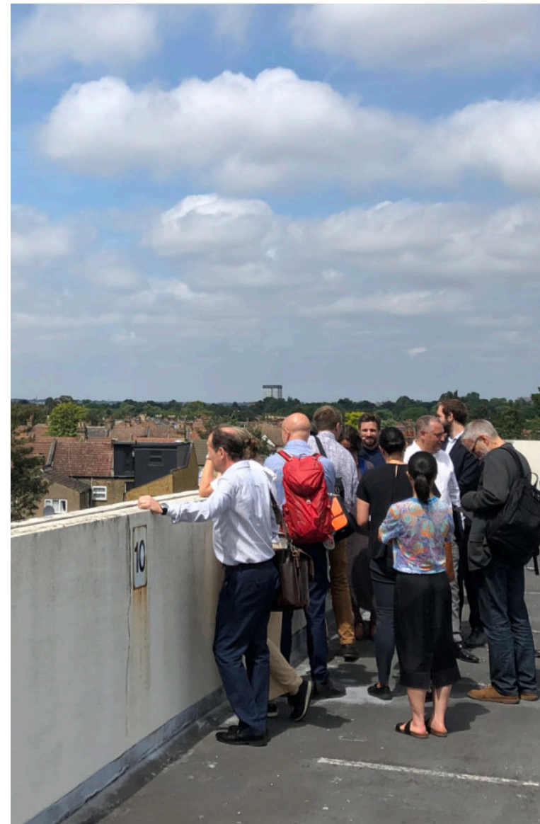
Redbridge Design Review Panel site visit

From time to time, it may be of benefit for specialist advice to be provided beyond the panel membership. In such cases, a professional with the relevant expertise may be invited to attend a review meeting, participating in the discussion with the status of an adviser to the panel.