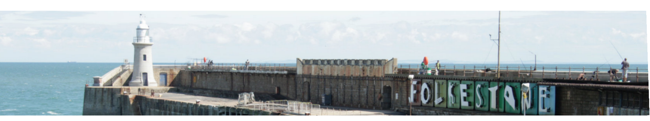
Folkestone Harbour

Large projects, for example schemes with several development plots, may be split into smaller elements, to ensure that each component receives adequate time for discussion.