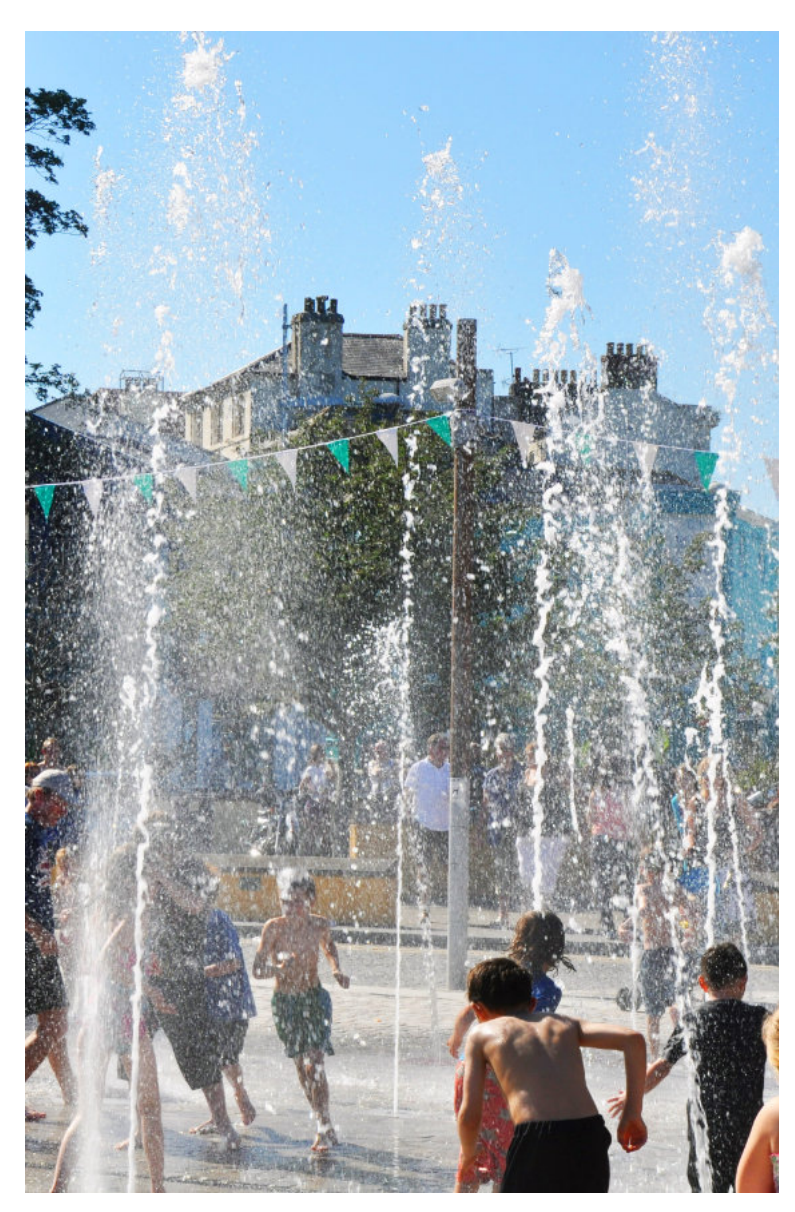
Folkestone Fountains