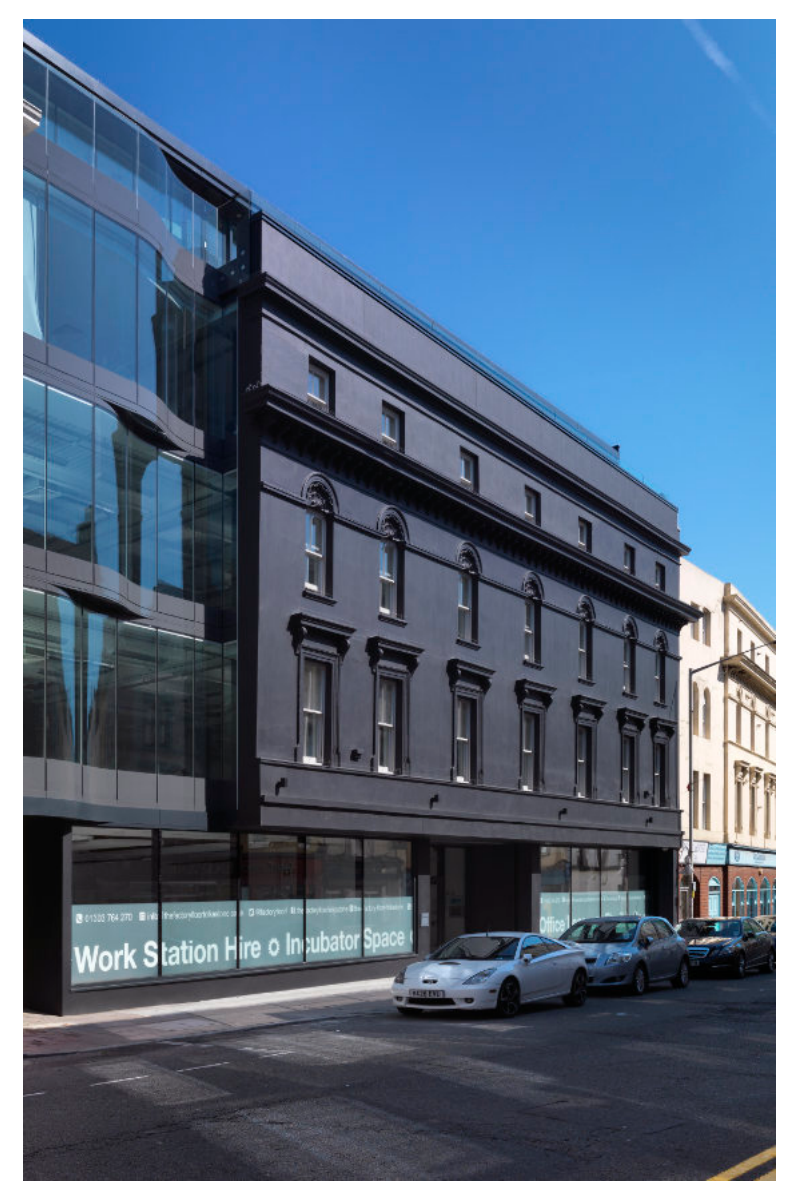
The Workshop, Guy Hollaway Architects