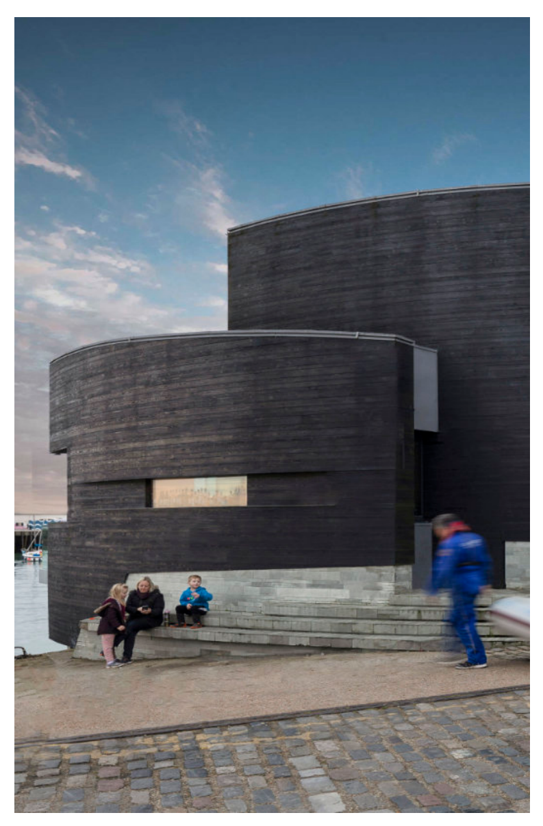
Rocksalt Restaurant © Guy Hollaway Architects

If the proposal is reviewed at an application stage the report will be a public document kept within the proposal's case file and published on Folkestone & Hythe District Council's website. Where the final review of a scheme takes place at a pre-application stage, the report of this meeting may also be made public once an application is submitted.