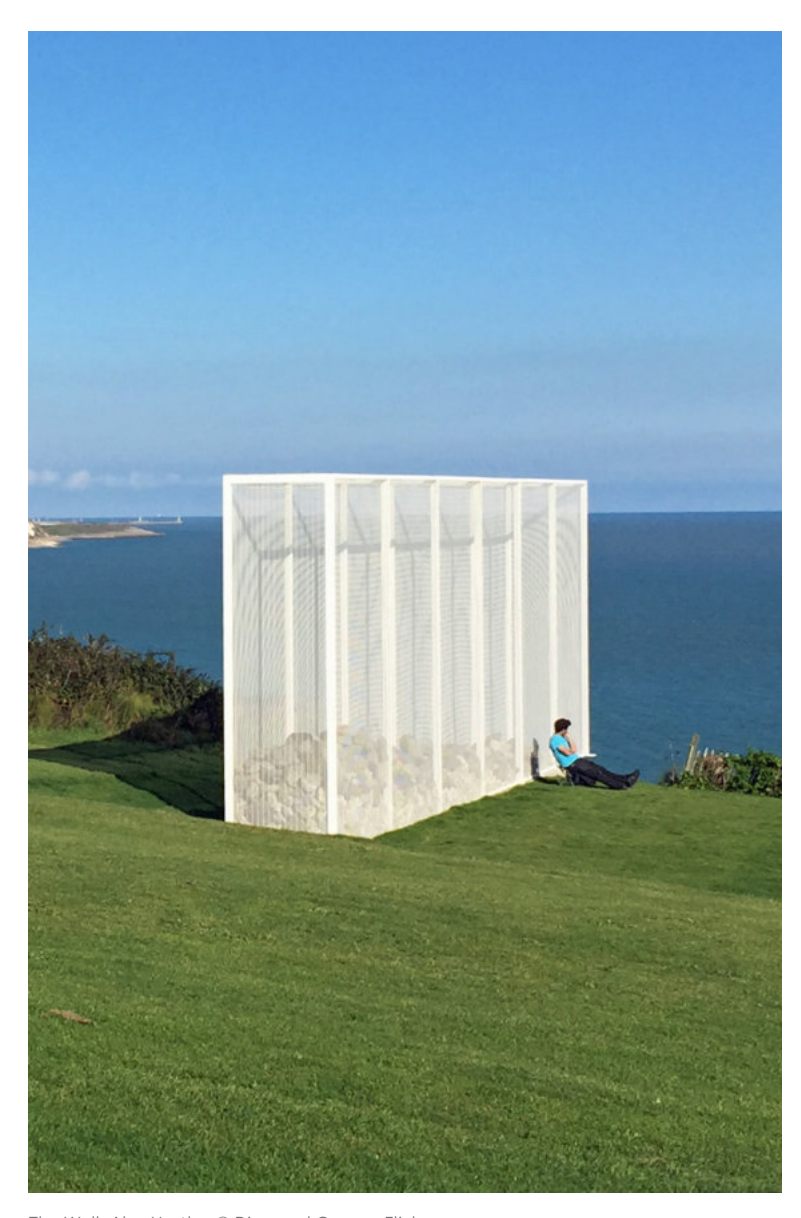
The Wall, Alex Hartley