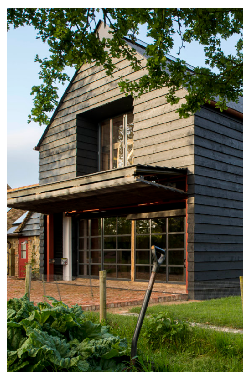
Ancient Party Barn, Liddicoat & Goldhill

If any points made by the Place Panel require clarification, it is the responsibility of the applicant and their design team to draw this to the attention of the chair of the panel (if during the meeting) or the panel manager at Frame Projects (if the report requires clarification).