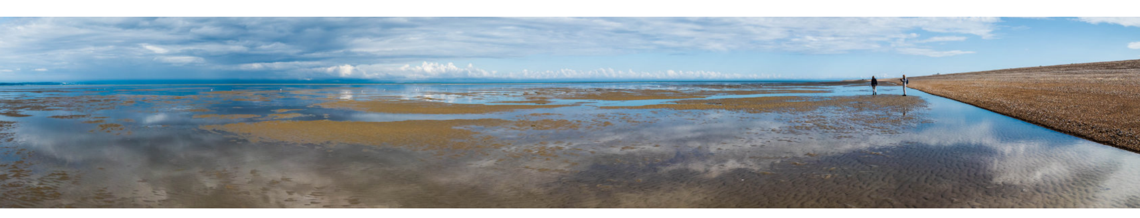
Lydd-on-Sea, Romney Bay

Design Review: Principles and Practice Design Council CABE / Landscape Institute / RTPI / RIBA (2013)