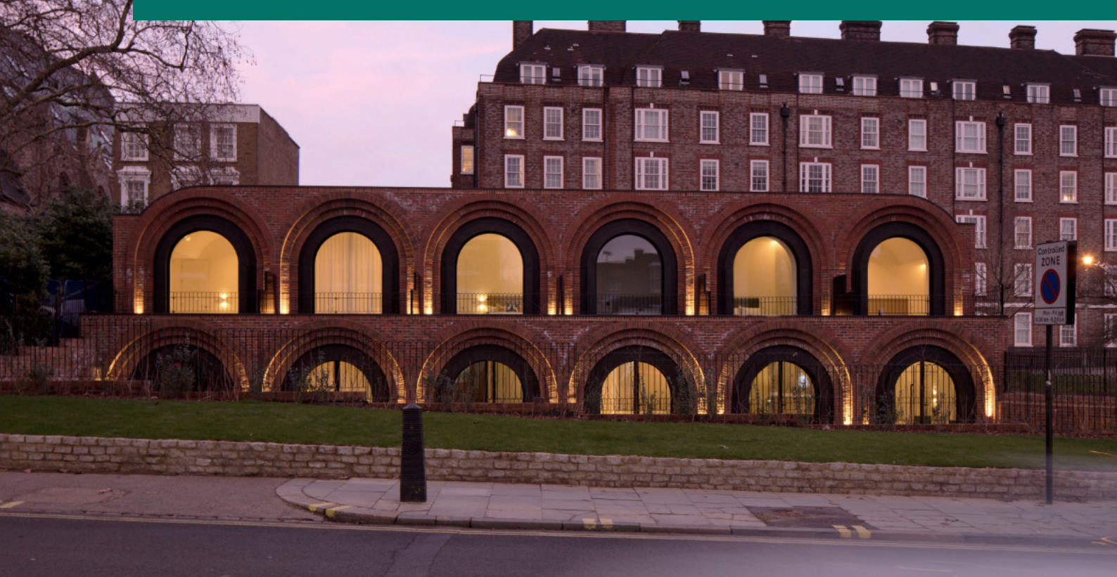
Image: The Arches